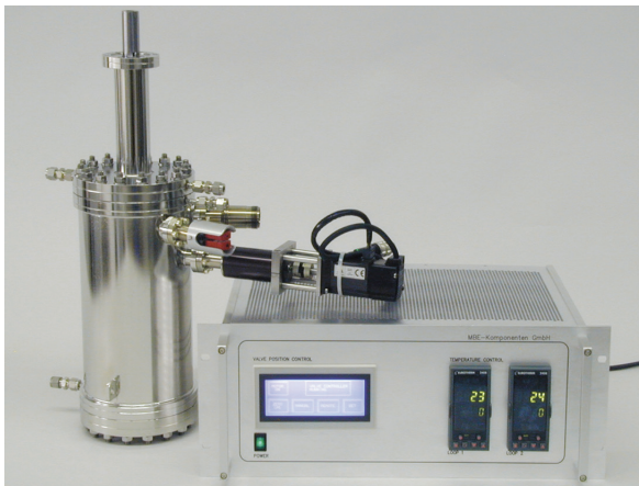
VACS 40-500-K-M with motor drive and motorized valve control unit MVCU

The Valved Arsenic Cracker Source VACS is designed for high performance growth of III-V materials.