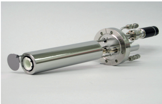
Organic Effusion cell OEZ 63-35-33-S with 35 cm 3 crucible, mounted on a DN63CF (O.D. 4.5") flange, with integrated water cooling and rotary shutter